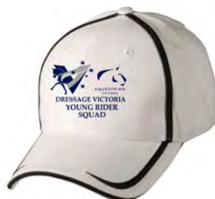
Cap White Navy $17.00