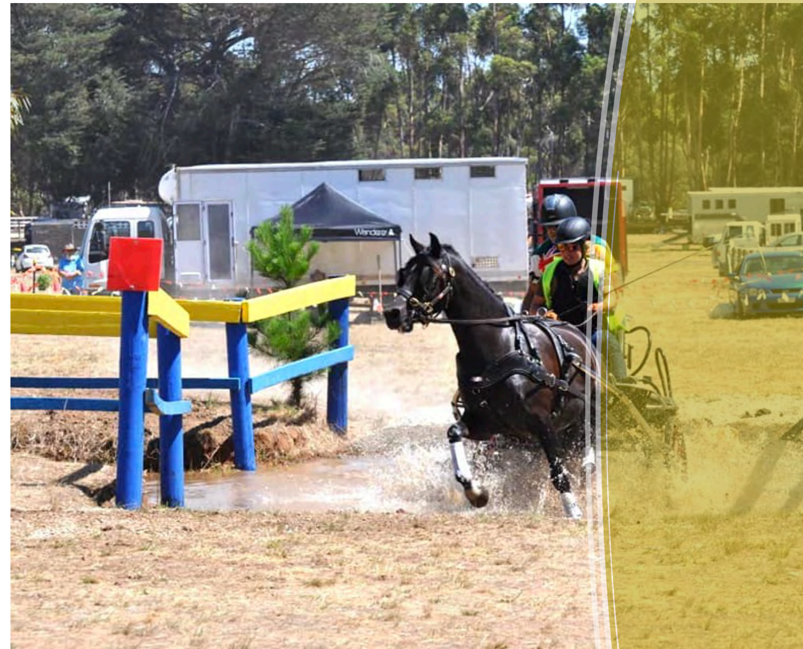
RUBY LAWRENCE | 2019 DRIVER OF THE YEAR

It is an exciting time ahead for carriage driving in Victoria, and hopefully Australia as we build EA Driving across the states and develop athletes for the future.