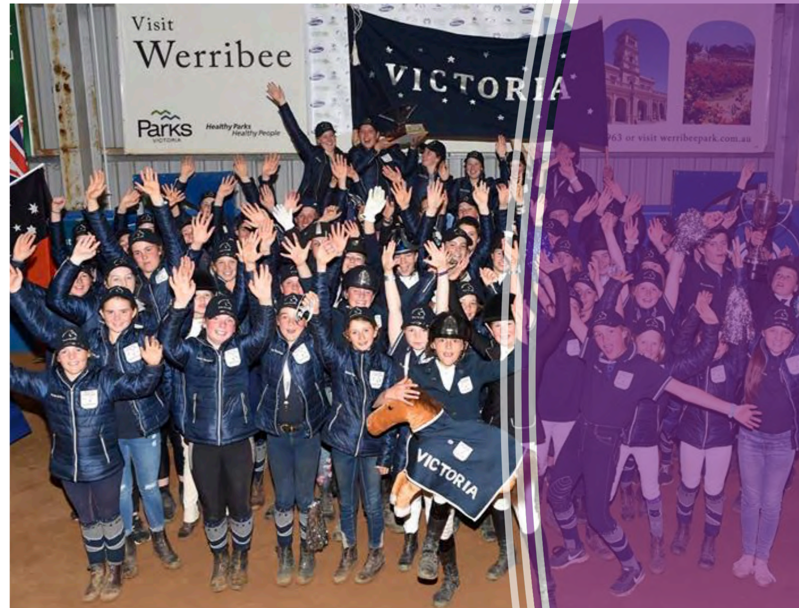
VICTORIAN INTERSCHOOL TEAM